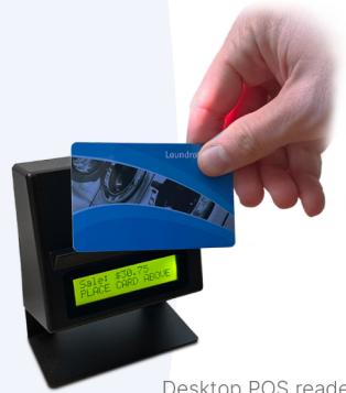
Desktop POS reader